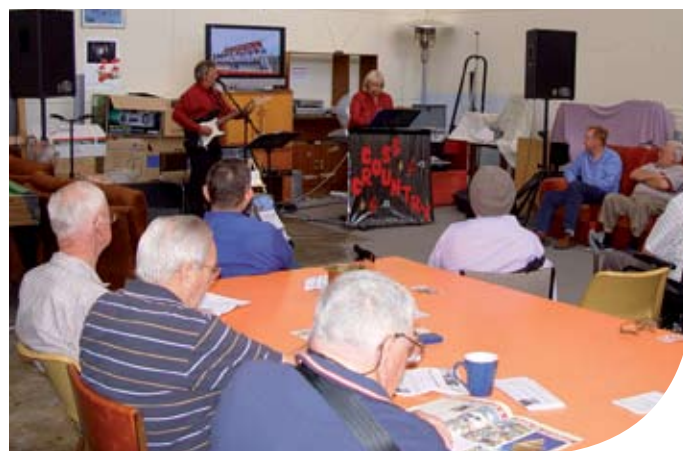
THE MEN'S GROUP ENJOYING THE ENTERTAINMENT PROVIDED BY CROSS COUNTRY PRIOR TO THE BIG RACE.

On Tuesday 7 November the group's day fell on Melbourne Cup, so the session took on a different feel with the Melbourne Cup Carnival coming to Edinburgh!!