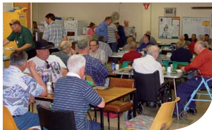
THE MEN'S GROUP ENJOYING THE MELBOURNE CUP LUNCH CATERED BY THE X-MRC.