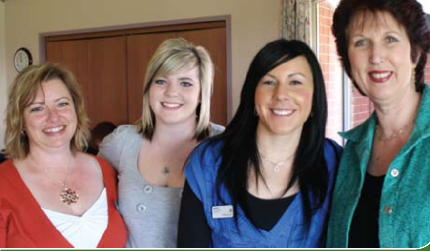
Helping Hand staff attending Staff Appreciation Lunch