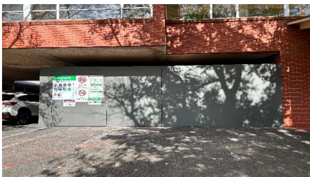
External Temporary Hoarding - Buxton

You may have noticed that the temporary hoarding has been installed next to the entrance to Rotary House and inside next to Reception. This will be in place until October and during this time we kindly ask that you use the central lift next to Grivell Hall.