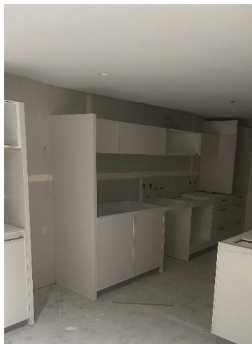
Cabinetry in the new eatery