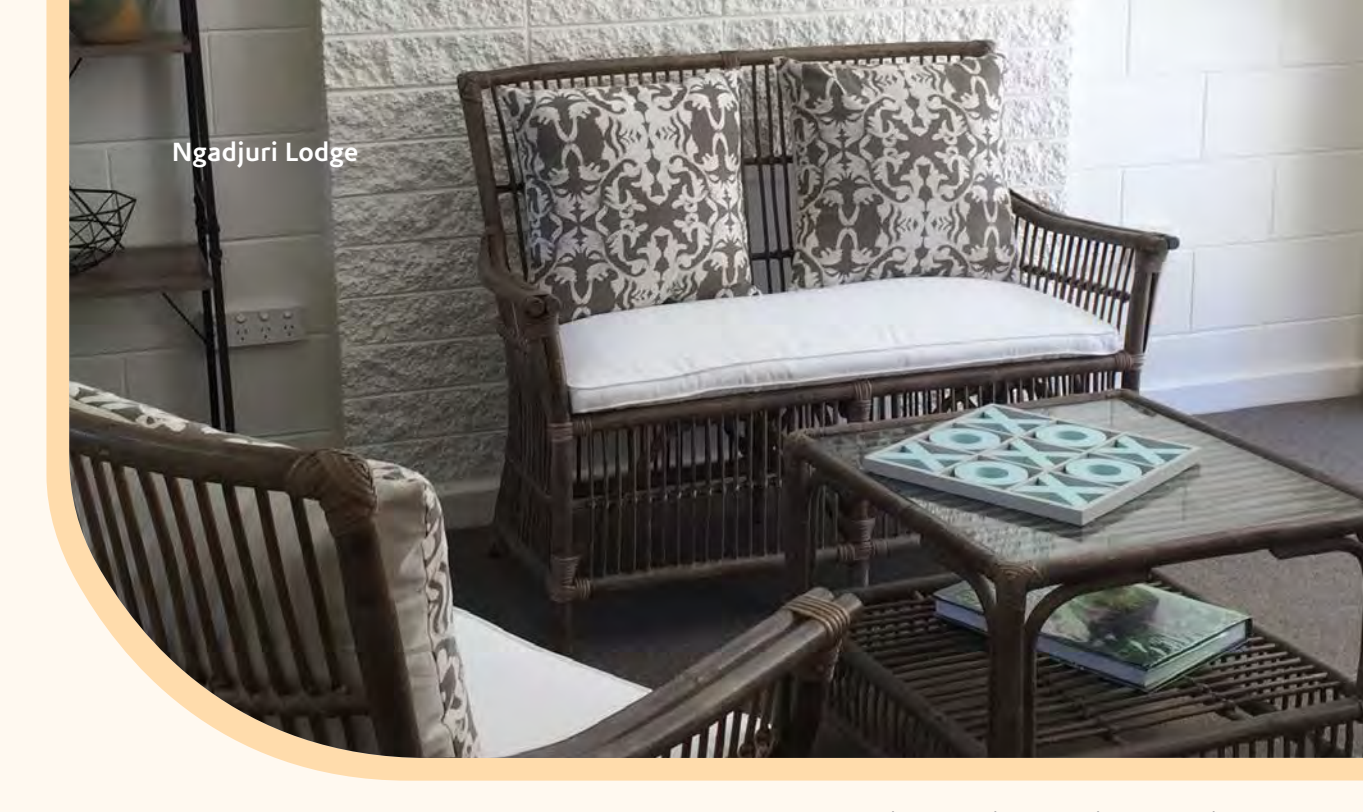
Interior photographs are indicative only