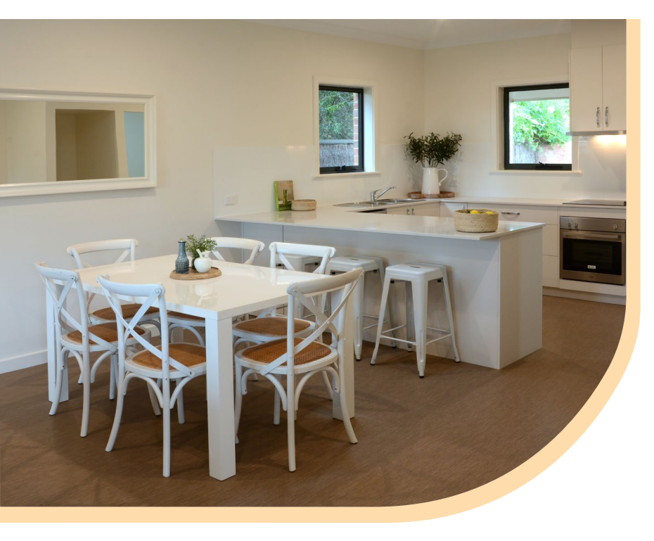
Interior photographs are indicative only